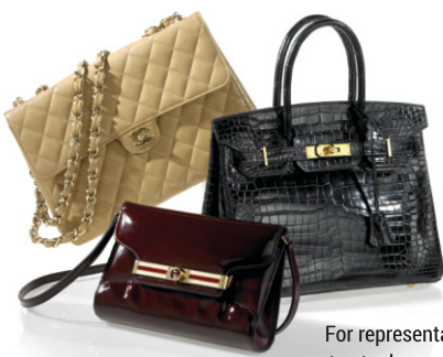
For representation only not actual opportunity item