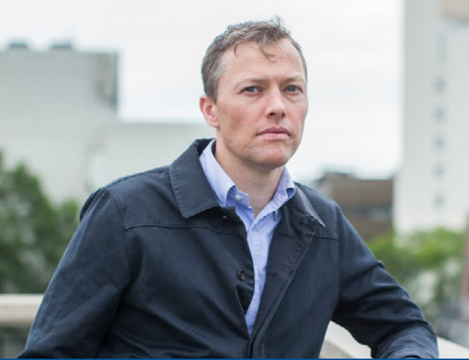
Keynote Speaker, Dr. Matthew Desmond